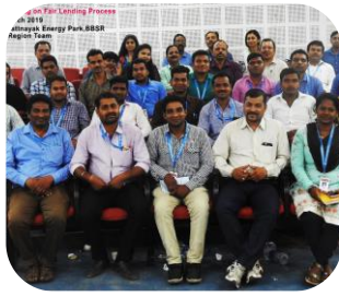
Refresher Training Programme