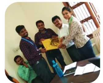
Staff Recognition at SFS